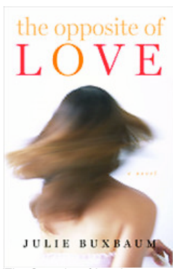
The Opposite of Love'

When she heads to Arkansas to work on the case with her married boss, she discovers he has booked them both in the same hotel room with just one bed. And he only goes further out of line from there.